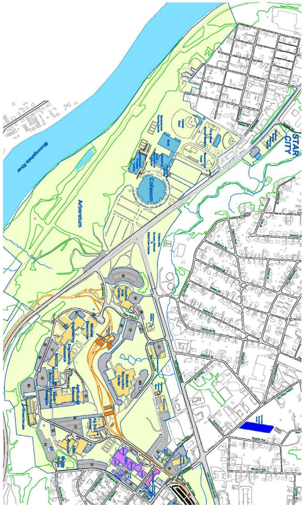
Evansdale Campus Map